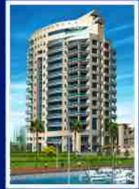
LA RESIDENCIA DEL MAR