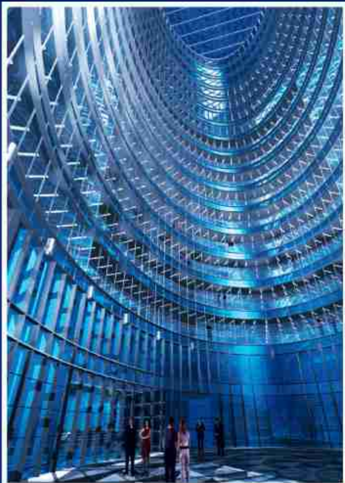
Central floor to ceiling glass atrium.

TECOM is located opposite Internet and Media City, with direct access to Sheikh Zayed Road and in close proximity to the hub of Dubai's growing residential developments